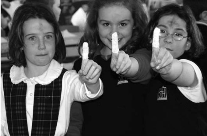
Children at St. Francis Xavier School in Wilmette show their finger casts.

Have you noticed a bunch of second graders with casts on their fingers? Don't worry, their fingers aren't really broken. It's a sign of spring that comes each March when The Auxiliary's Hospitals to Children program is in full swing! Presented by Auxiliary volunteers, the Hospitals to Children program is designed specifically to teach second graders about the hospitals in their community. The program describes the hospital as a "city under one roof." A PowerPoint presentation takes the students on a trip through the Hospitals of NorthShore University HealthSystem and illustrates three situations in which they might have to go to the hospital. Students have time to ask questions and investigate items brought by the volunteers, such as X-rays, blood pressure cuffs and stethoscopes. Students may have one of their fingers put in a cast—always a favorite activity. At the program's conclusion, students receive a coloring book, a letter to their parents and valuable information about keeping emergency numbers and parental consent forms available for caregivers.