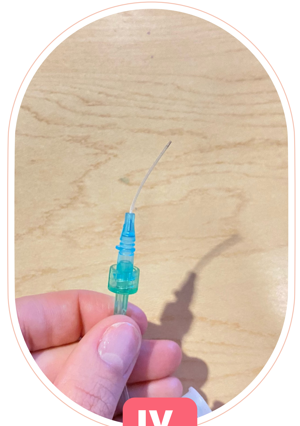
IV Arm Straw